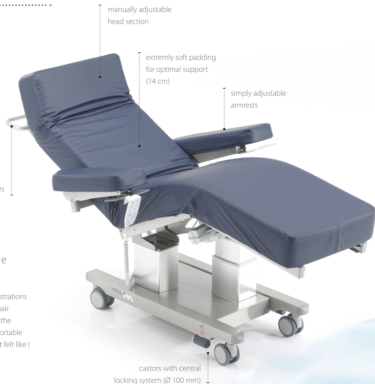
manually adjustable head section