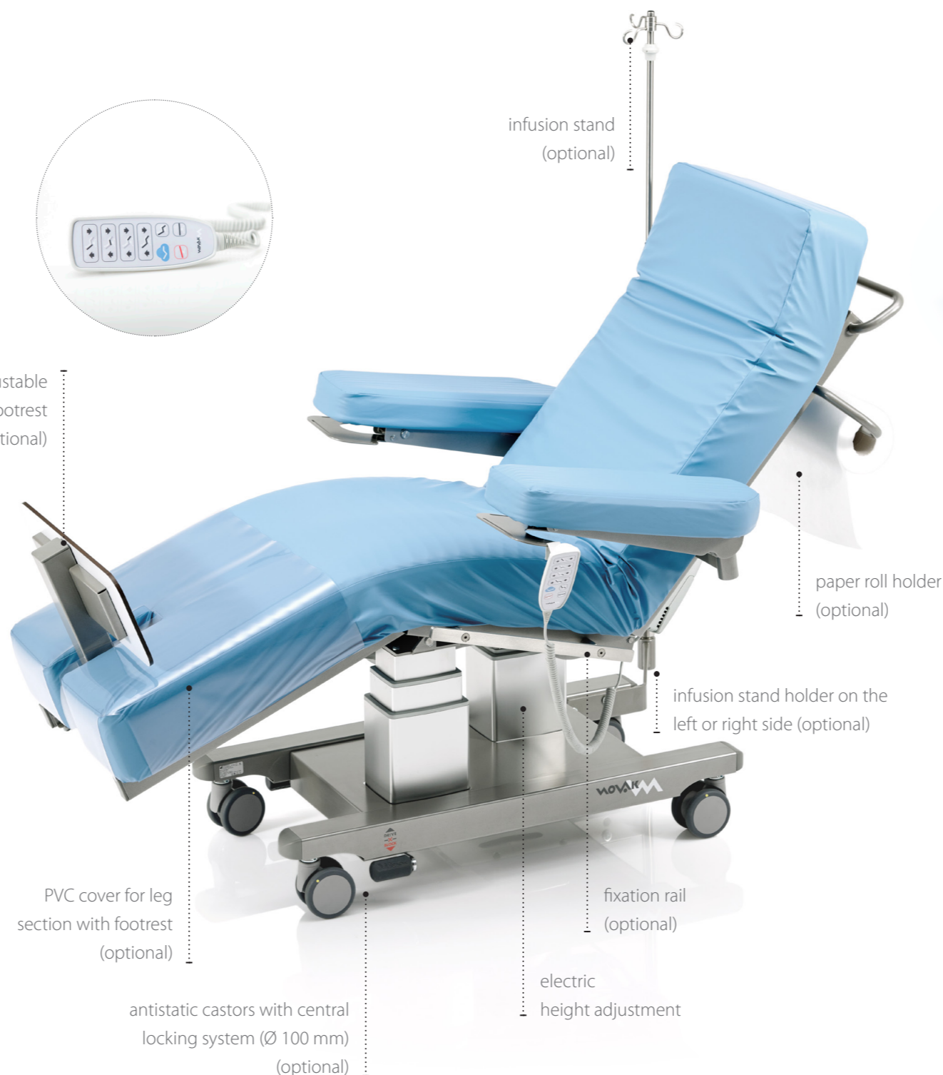
infusion stand (optional)